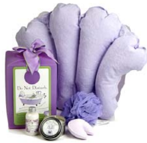
Do not Disturb $35.