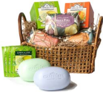
Give Mom Me-Time $29.

This Mother's Day take the opportunity to show your mom just how much you appreciate her. Whether she loves to cook, enjoys sitting down with a cup of tea, or simply needs a few things to help her relax, we have the perfect selection of gifts to say, "I love you."